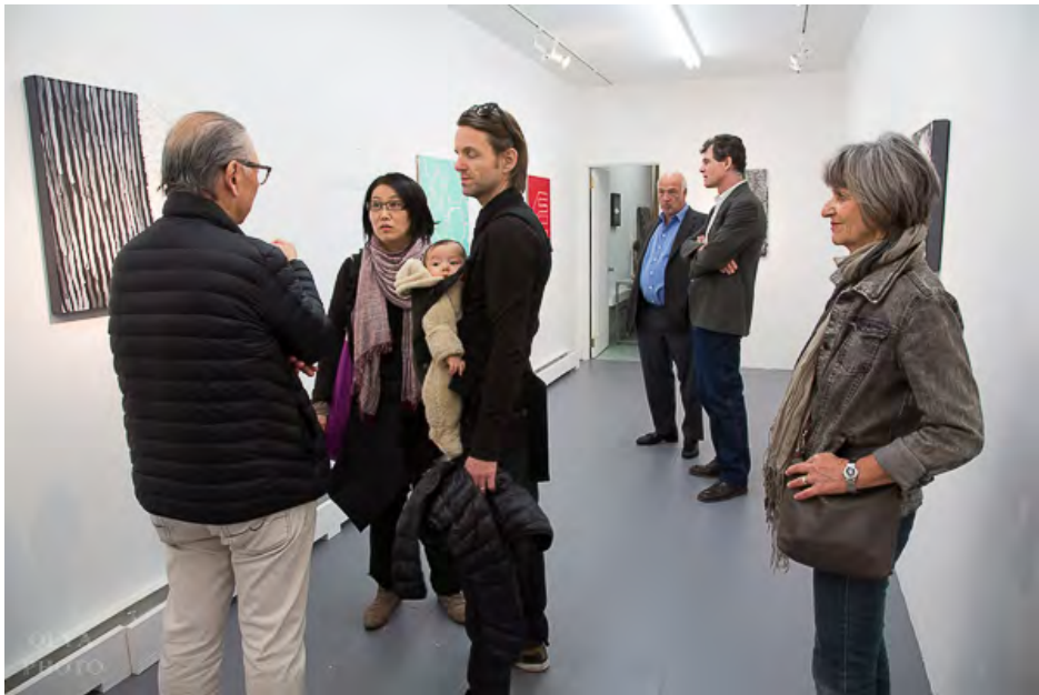
All in good company on the LES