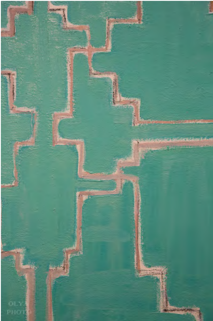
Close up detail of work by Paul Pagk