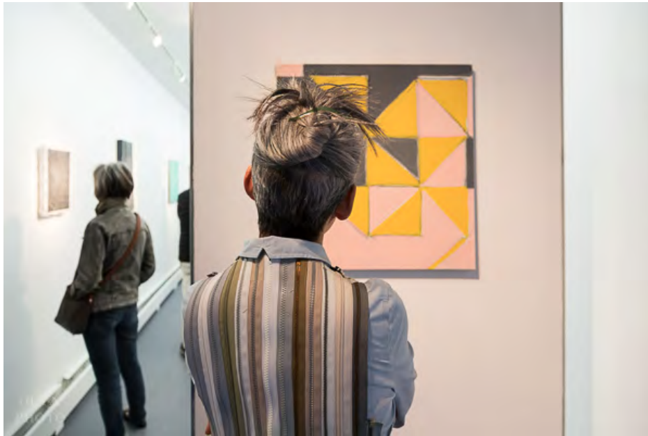
Admiring Art on Thursday Night