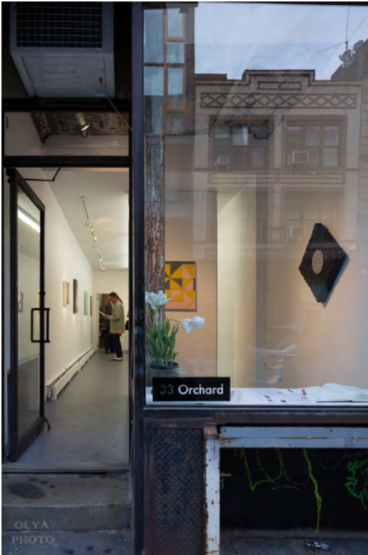
33 Orchard on Art Night