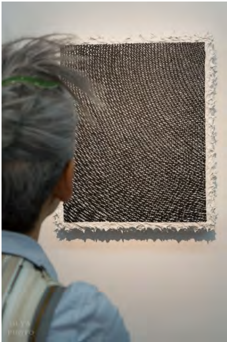
Up Close and Personal with the Art